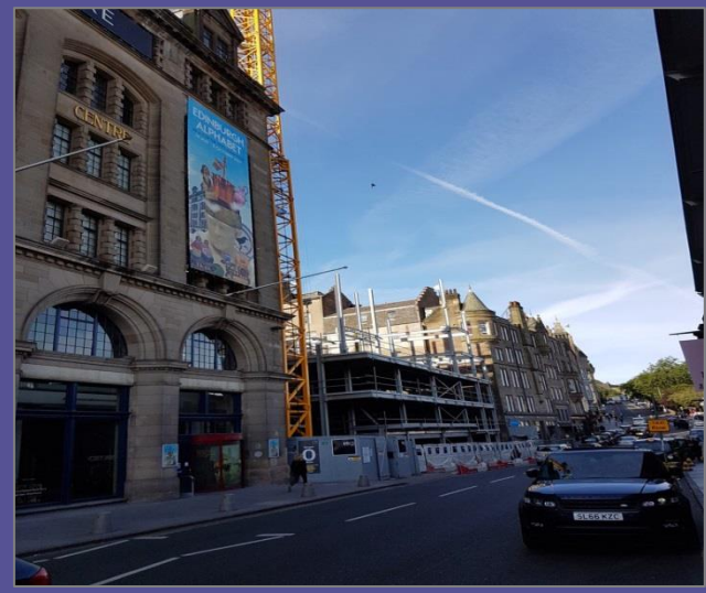
Market Street Hotel Development

The contractor has been featured in construction news highlighting the engineering challenges in building this constrained UNESCO World Heritage site.